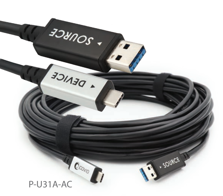
USB 3.2 Type-C Cable Supports 10GBPS data rate Lengths up to 75 feet

Covid stocks a variety of plenum and nonplenum cable assemblies available in standard lengths from 6 inches to 1000 feet. When your installation calls for custom cable assemblies, Covid's highly skilled engineering and production teams can provide you with the perfect solution for any requirement.