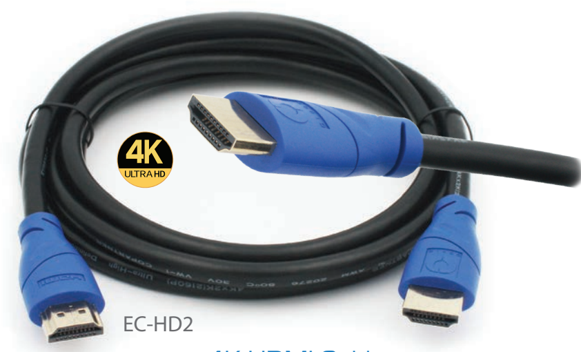
4K HDMI Cable AMA Braid Shield Construction 18G, 4K Ultra HD