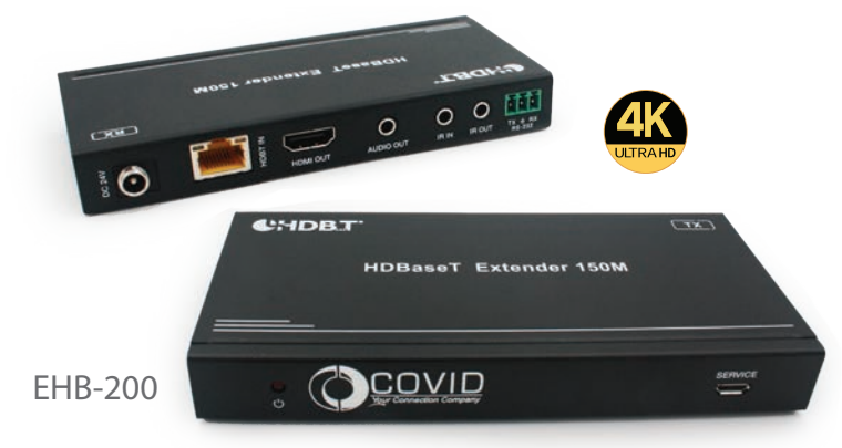
4K HDBaseT Set 18G, 4K Ultra HD Local Loop Out