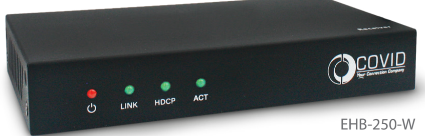
4K HDBaseT Set 18G, 4K Ultra HD up to 230 ft USB 2.0 De-embedded audio