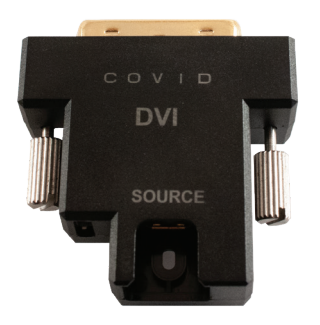
ADC-DVI-TX DVI Tx