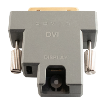
ADC-DVI-RX DVI Rx