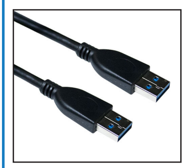
Covid Part Numbers

A Male to A Male | A Male to B Male | A Male to A-Female