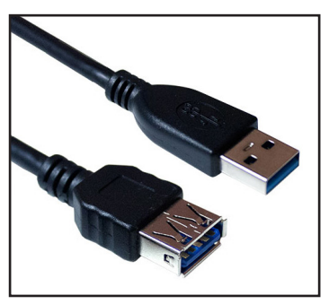
Covid Part Numbers